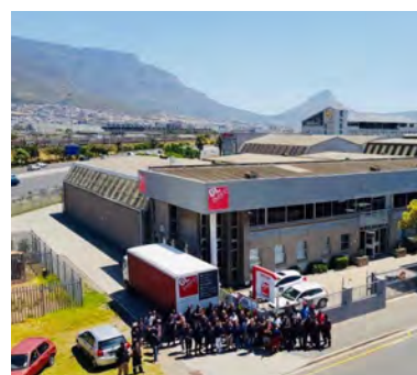
GL EVENTS CAPE TOWN