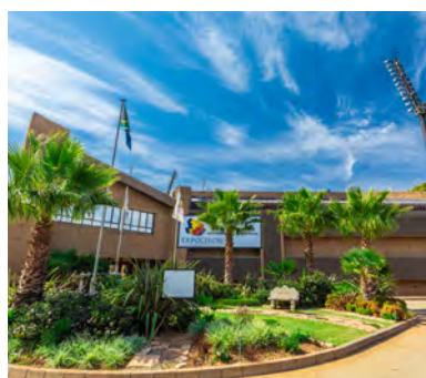
GL EVENTS JOHANNESBURG